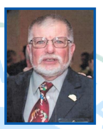
Referee PIAA Official 50 Years 15 Years Tournament Scoring Worker 10 Years Youth Wrestling Coaching